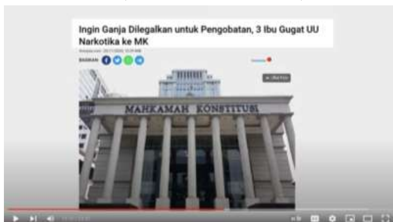
Figure 8. Kompas Mass Media (Youtube LGN_ID TV 2024)

The text code, which appears in the film is a national mass media that tells three people Mother sued the Drug Act to the MK. There is a made headline on the media 3 Mother begs Legalization of Ganja for treatment and 3 Mom sues the Narcotics Act to MK", informing the audience that the story of the documentary film Musa is a real story experienced by 3 mothers who fight for marijuana for treatment. This story is not an original story made fictitiously. The story of this film is taken from three mothers who have children with cerebral palsy. (lumpuh otak). In line with the analysis using John Fiske's semiotic reality level in the Musée documentaire, of the code of appearance, dress code, gesture code, expression code, and text code. It has elements of the struggle efforts of mothers in the use of marijuana for medicine.