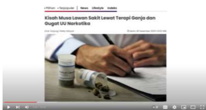
Figure 2. Mass media views on the film Musa (Youtube LGN_ID TV 2024)

On June 26, 2022, the HI Bundaran was reconciled with the action on medical marijuana. The action was carried out by Santi Warastuti along with the husband and daughter who suffered from cerebral palsy, this action was done in Bundaran HI on Sunday during the care free day activities with a special purpose in fighting for treatment with the legalization of medical marijuana. In support of the action, Santi's mother made a poster as a form of medical legalization of marijuana for her son suffering from cerebral palsy. Cerebral palsy or cerebral paralysis is a damage that occurs in an immature brain with indications of movement and posture disorders. In Indonesia, cannabis is included in the category I of the Narcotics Act, which is a substance that has a high potential for abuse in this maritime state. Once a community that supported the use of marijuana for therapy was formed, the debate over the legalization of the drug began to gain widespread coverage in the media. Added several neighbouring countries that have already begun legalizing marijuana for Health by 2022.