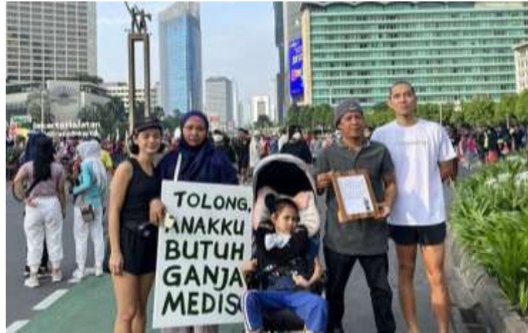
Figure 1. Action at the HI roundabout car free day (INewsYogya.id 2022)

with other objects or events that are relevant to society. In addition to its function as entertainment, the mass media also offers entertainment to the audience and its readers as a means of removing tiredness and distracting minds from the social issues that exist in society.