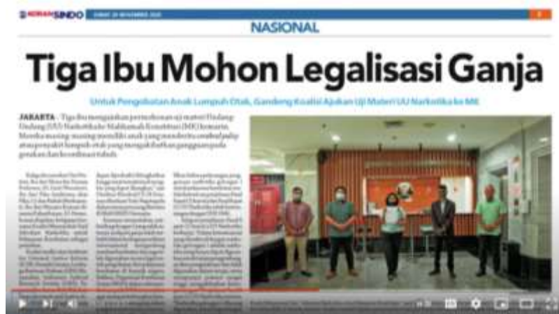
Figure 8. Sindo Newspaper Mass Media (Youtube LGN_ID TV 2024)

Next is the text code, I see some national mass media reporting the struggle of mothers who sued the Narcotics Act to the Constitutional Court.