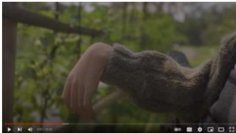
Figure 4. Close up symbol of Musa hand

Next is the code gesture, see the appearance of Musa who has cerebral palsy in the documentary "Musa"